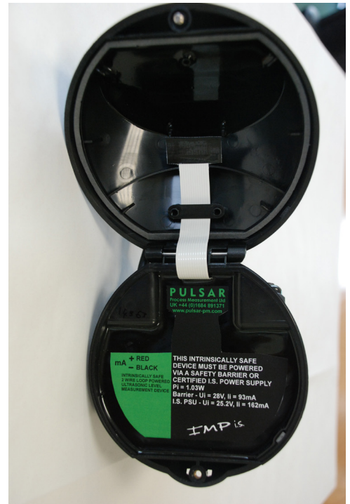
Inside the lid of an IMP+ I.S.