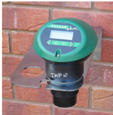
Optional mounting bracket for IMP sensors