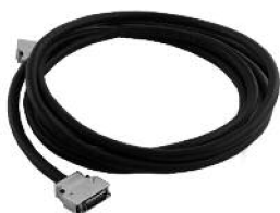
VUSCREEN Link cable