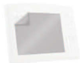
Display protective foil