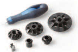
Centering device kit 8 mm