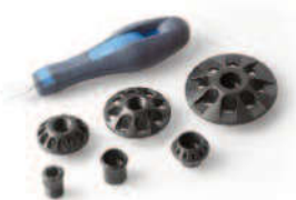
Centering device kit 8 mm