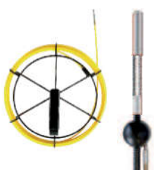
Glass fiber pushing aid 15 m

Small reel containing 15 meter / 4.5 mm PE-coated glass fibre push rod and one spherical adapter including clamps and clockwise / counterclockwise thread-connector. Unique tool to move longer insertion tubes of any 6mm scope into hard to reach positions. Change of clamps allows to use same set with different scope diameters. Includes mounting wrench.