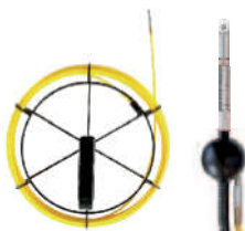
Glass fiber pushing aid 15 m