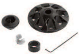
Centering device kit 6 mm