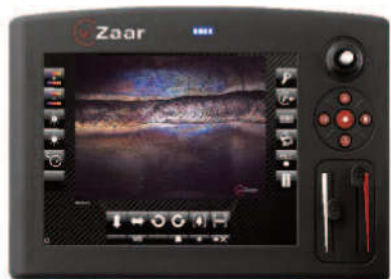
VUSCREEN control unit