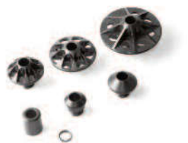
Centering device kit 12.7 mm