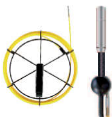
Glass fiber pushing aid 15 m

Small reel containing 30 meter / 4.5 mm PE-coated glass fibre push rod and one spherical adapter including clamps and clockwise / counterclockwise thread-connector. Unique tool to move longer insertion tubes of any 8mm scope into hard to reach positions. Change of clamps allows to use same set with different scope diameters. Includes mounting wrench.