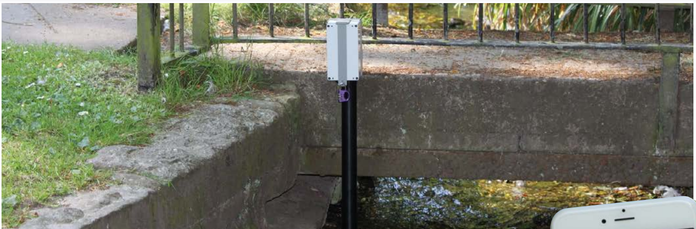
LevelLine-EWS deployed along a shallow riverside

The LevelLine-EWS system is an automated alert system that will notify you of rising water levels any time of the day or night via SMS, giving you vital time to safeguard any assets that may be at risk from flooding