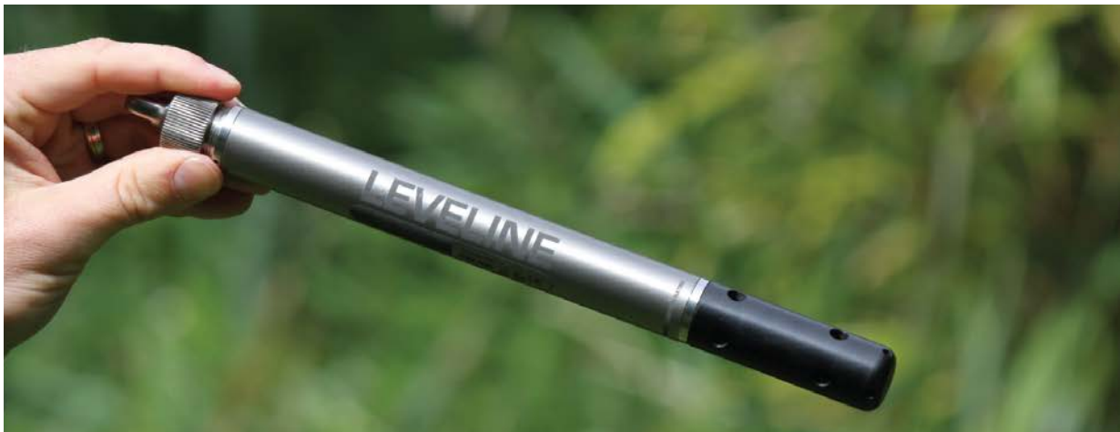
LevelLine-CTD with nose cone fitted

One of the questions raised when monitoring water level is, “what is causing the changes that I am recording?” Monitoring the conductivity can give an indication of the source of the water causing the water level to change. This is particularly useful in salt water intrusion studies in coastal regions.