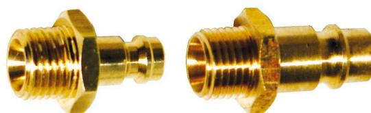
Quick-release coupling nominal width 7.2 external thread G1/4"